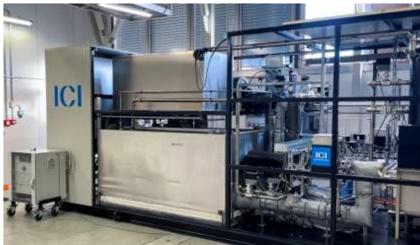
The SO-FREE prototype assembled in the ICI laboratory